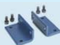
J Mount Kit