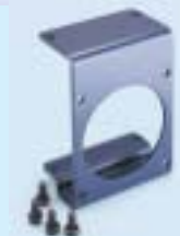
Output Flange Mount Kit