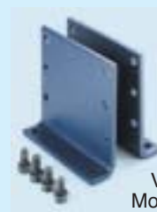
Vertical Mount Kit