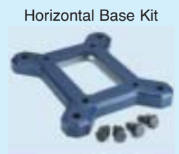
Horizontal Base Kit