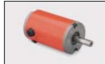
31 Frame, 3.11" diameter