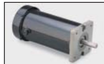
34 Frame, 3.38" diameter