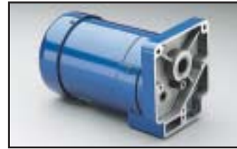
Custom Application Specific Mounting

④ Additional voltage ratings of 48, 60, 72 or other inputs also available.