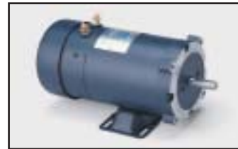
56C Face Mounting