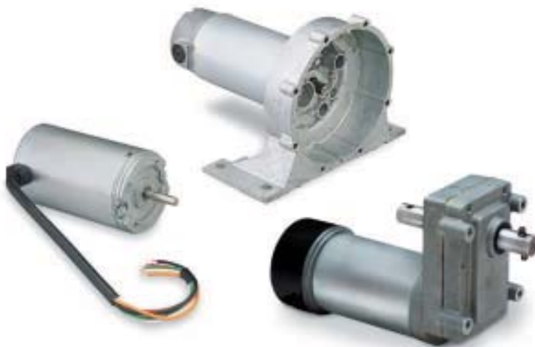
TYPICAL TRU-TORQ CUSTOM MOTORS

LEESON's application engineering staff is available, at no additional cost, to assist in developing the motor design best suited for applications.