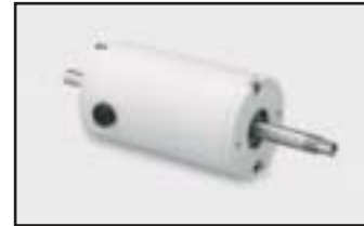
24 Frame, 2.38" diameter