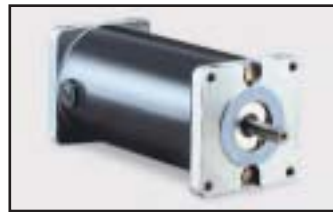
34 Frame, 3.38" diameter