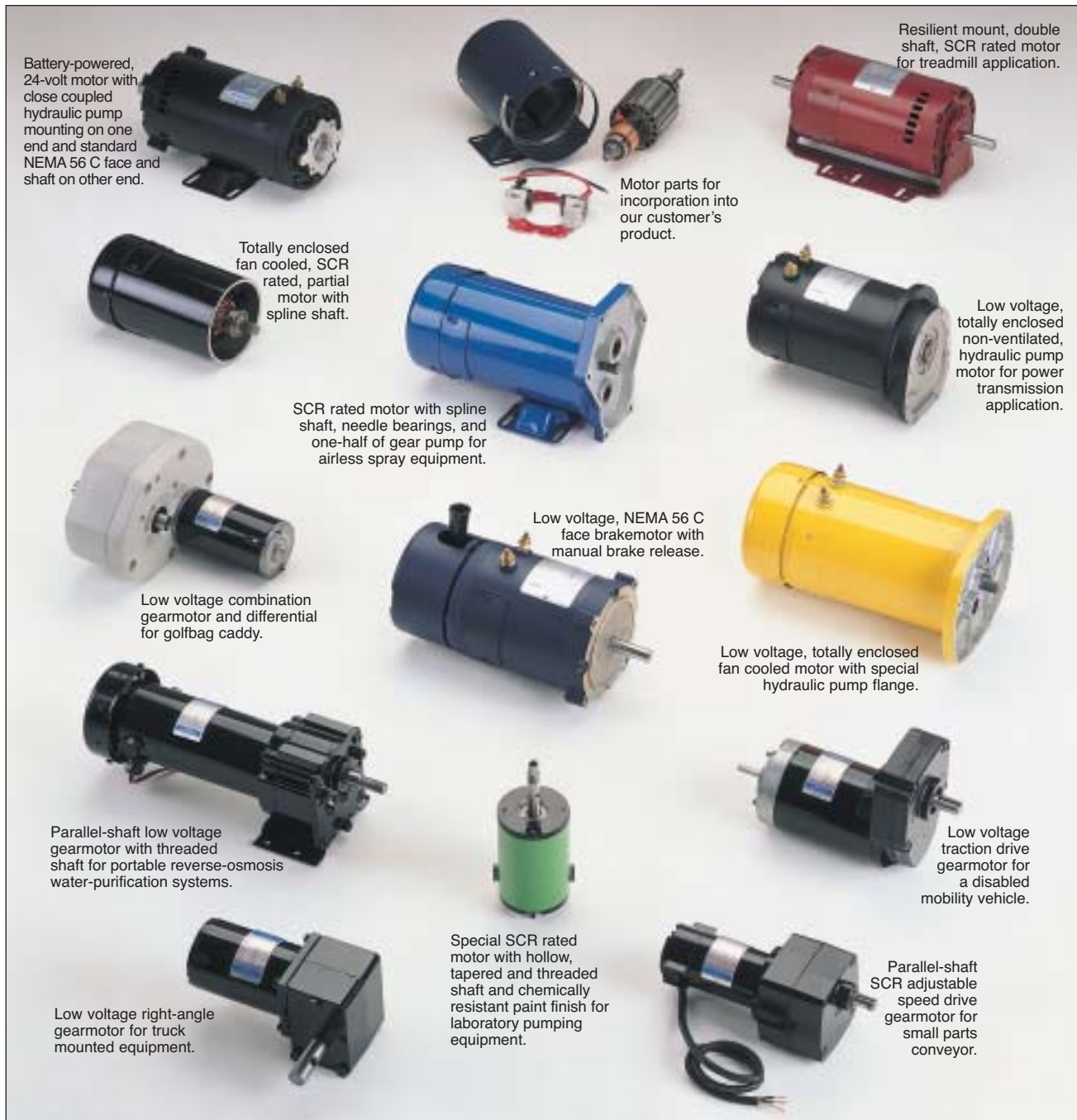
Battery-powered, 24-volt motor with close coupled hydraulic pump mounting on one end and standard NEMA 56 C face and shaft on other end.