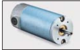
31 Frame, 3.11" diameter