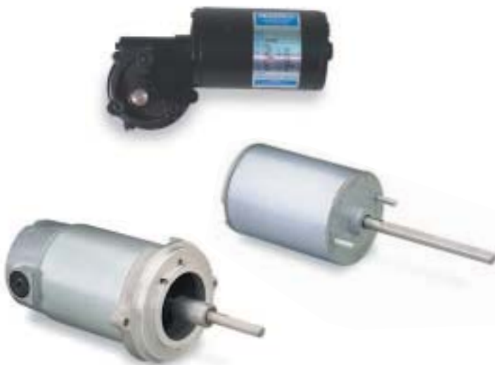
TYPICAL TRU-TORQ CUSTOM MOTORS

LEESON's application engineering staff is available, at no additional cost, to assist in developing the motor design best suited for applications.