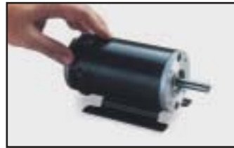
24 Frame, 2.38" diameter

For dimensions, see drawings A , B , C or D on page 32.